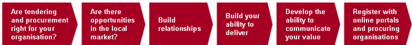
Diagram 2: Procurement steps

There are a number of key challenges your social enterprise can face when you enter a procurement process. Below are a series of steps or things that you should consider or have in place if you wish to deliver public sector contracts.