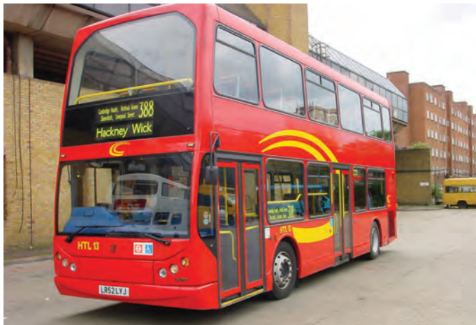
A bus run by social enterprise HCT

There are some very large social enterprises and ones that have been in existence for years – for example the Co-operative Group.