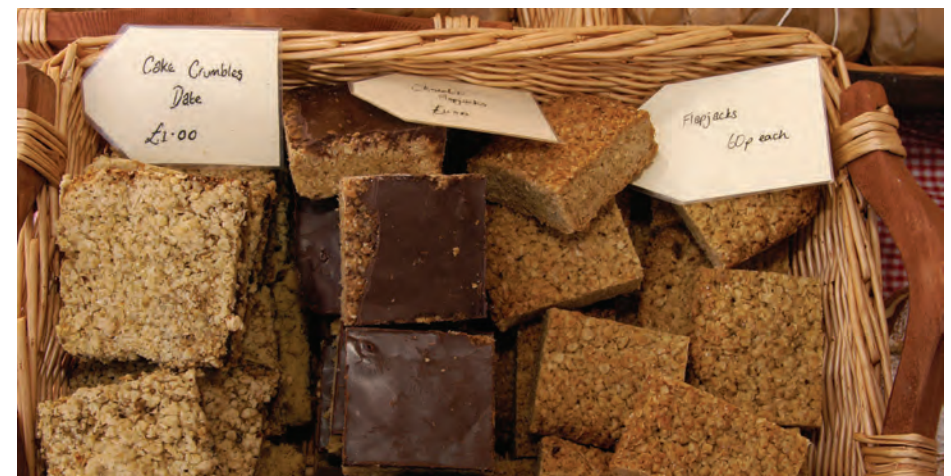
Cakes on sale at a farmers' market co-op

It's this combination of doing business and doing good that makes social enterprise one of the most exciting and fast-growing movements in this country and across the world.